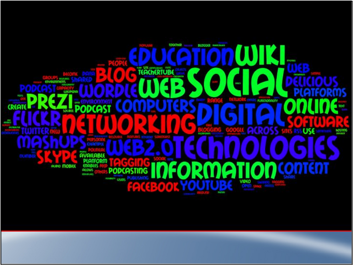
Jan 20-1:41 PM