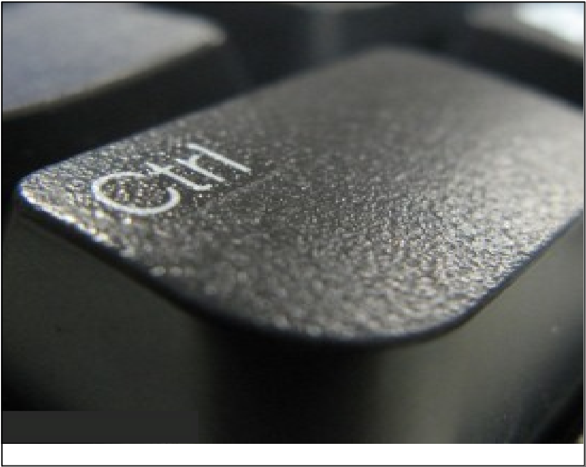
Jan 20-1:33 PM